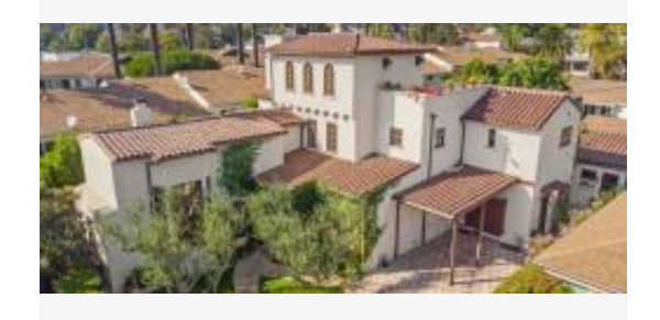
'Senorita' Songwriter Sells