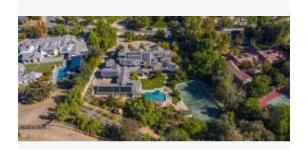
Amazing Hidden Hills Home With Incredible Star War's Collection!